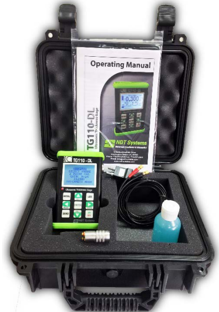
TG-110 Package including a probe