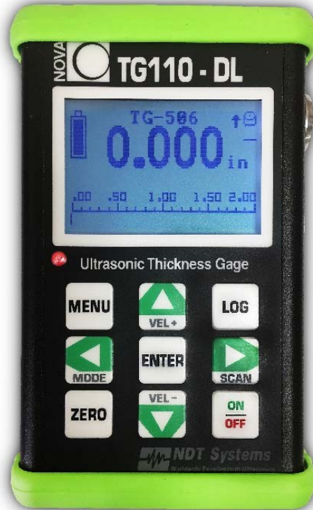
Customizable Data Logger