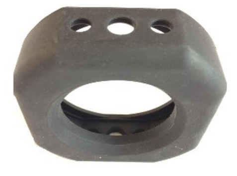
F111 Rubber Bumper