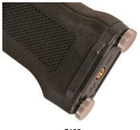
F105 MB Thumb Screws