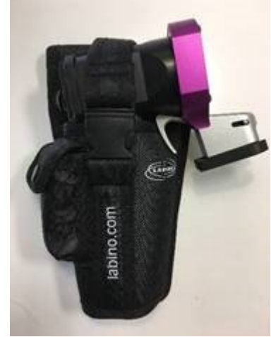
A504 MB Belt Holster